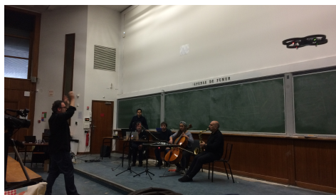
Figure 5: A rehearsal of the opera with drones and musicians directed by a Sound-painter

an issue in some situations and requires a lot of calibration to adapt to a given environment. In case the environment is not adapted (because of bad lighting for instance) the system can be augmented with external tags. We have experimented this approach in our Green Sword use case that consists in cleaning a green park with a swarm of air and ground vehicles and we obtained a correct location, even though not as good as what we had with motion tracking.