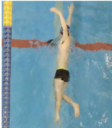
Figure 2: An image of a swimmer from the top using DJI Spark.