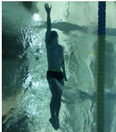
Figure 3: An image of a swimmer from under the water using GoPro HERO 6.